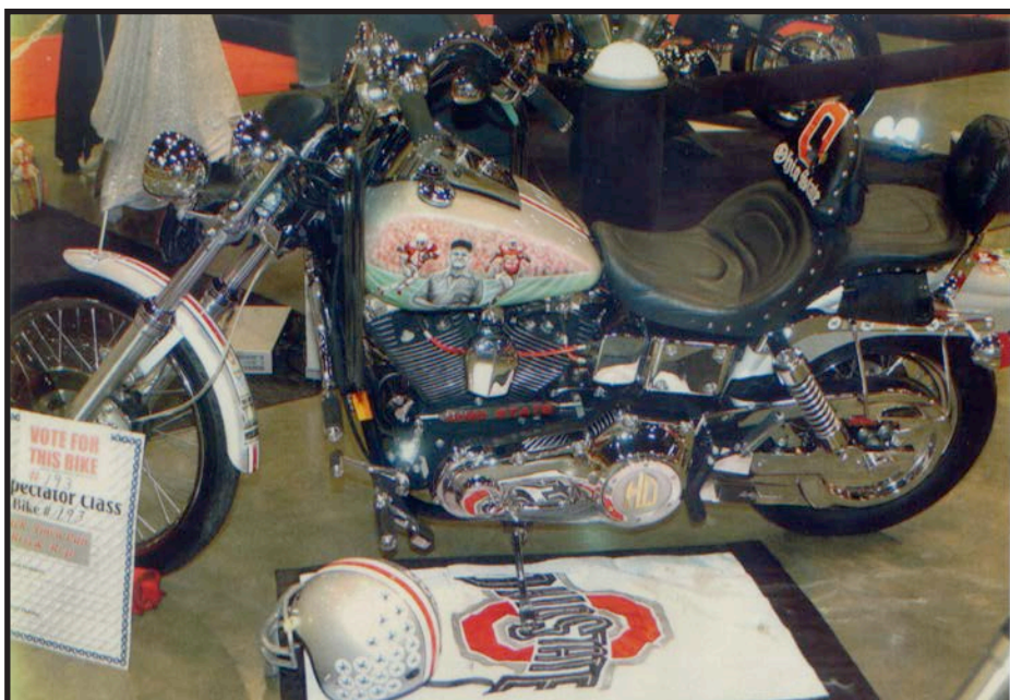
1997 OSU Harley Davidson Wide-Glide 43,453 miles • $10,000 OBO Custom airbrushed pictures on both fuel tanks of all Ohio State Heisman trophy winners plus Woody Hayes. Serious inquires only call (740) 334-2459.