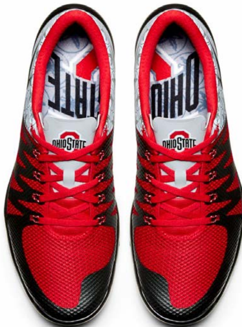
NIKE FREE TRAINER 5.0 V6 AMP*