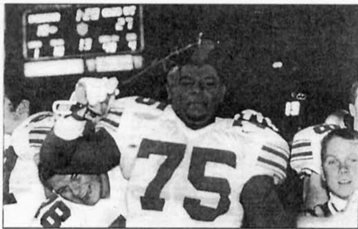
RECAPTURE THE FEELING — A teary-eyed Orlando Pace is pictured holding up a rose after OSU's Rose Bowl-clinching win over Indiana on Nov. 16. The Buckeyes lost their unbeaten season to Michigan a week later but still will play in the Rose Bowl Jan. 1.