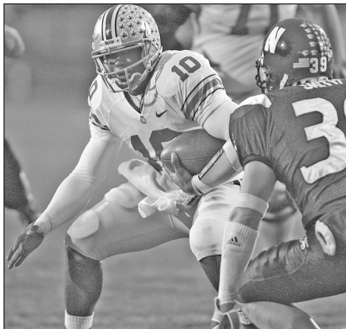
LOOKING FOR RUNNING ROOM — Ohio State quarterback Troy Smith (10) puts a move on Northwestern free safety Brendan Smith (39) during the Buckeyes' 54-10 win in Evanston. Smith accounted for 200 yards of total offense in the victory.

The offensive line was still without its usual starter at left tackle, Alex Boone, but played