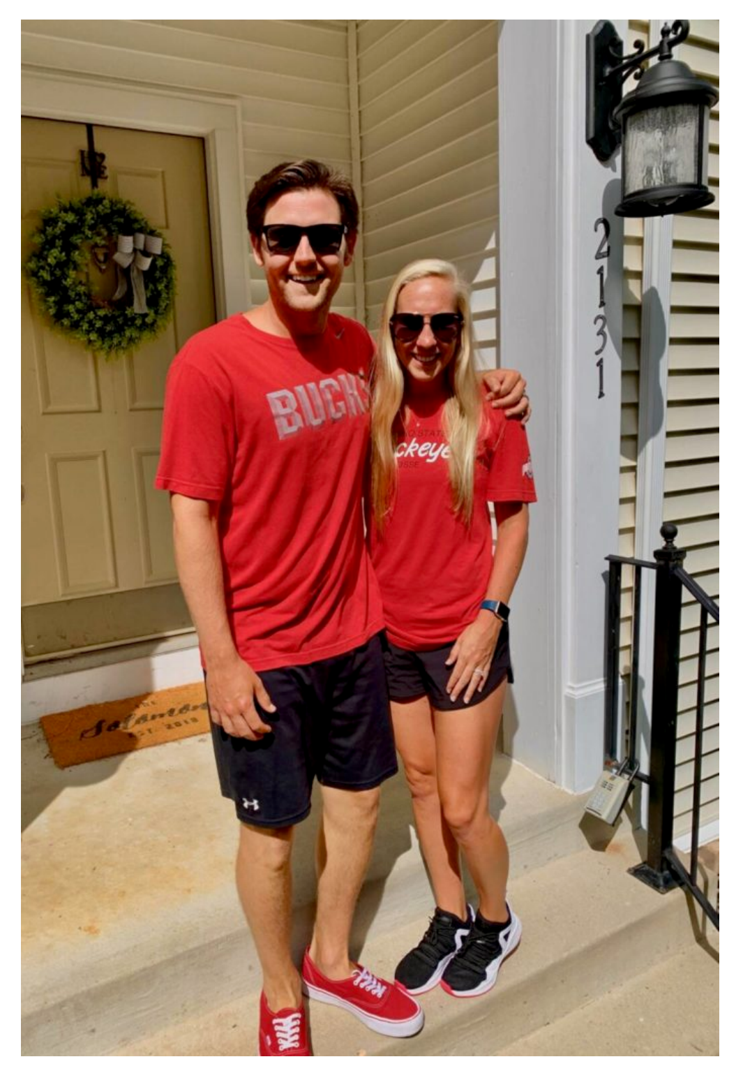
For four free issues of the now-monthly print edition of Buckeye Sports Bulletin, no card required, sign up at the link here: http://www.buckeyesports.com/subscribe-4issue-trial/

[divider line_type="Full Width Line" line_thickness="2" divider_color="default"][nectar_btn size="jumbo" button_style="regular" button_color_2="Accent-Color" icon_family="none" url="http://www.buckeyesports.com/boards/" text="Join The Conversation"]